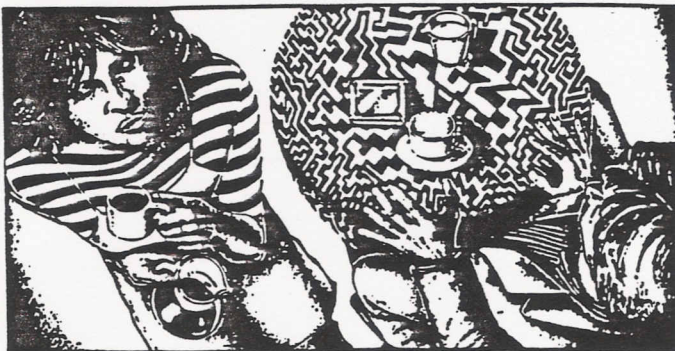
Limiting caffeine can help reduce stress.